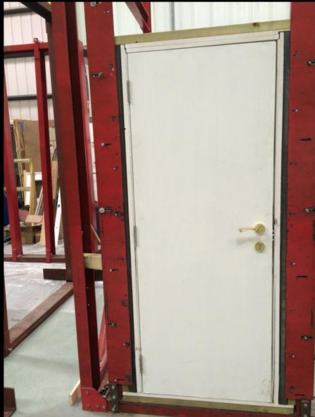
Image Showing No Damage To The Inside Face of The Door Having Been Attacked From The Outer Face, Displayed On Previous Slide