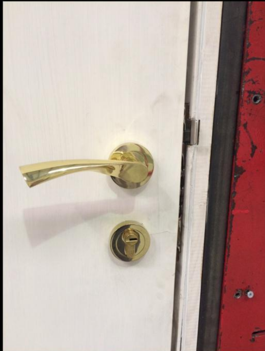
Image Showing No Damage To The Inside Face of The Door, Door Handle and Door Lock Having Been Attacked From The Outer Face