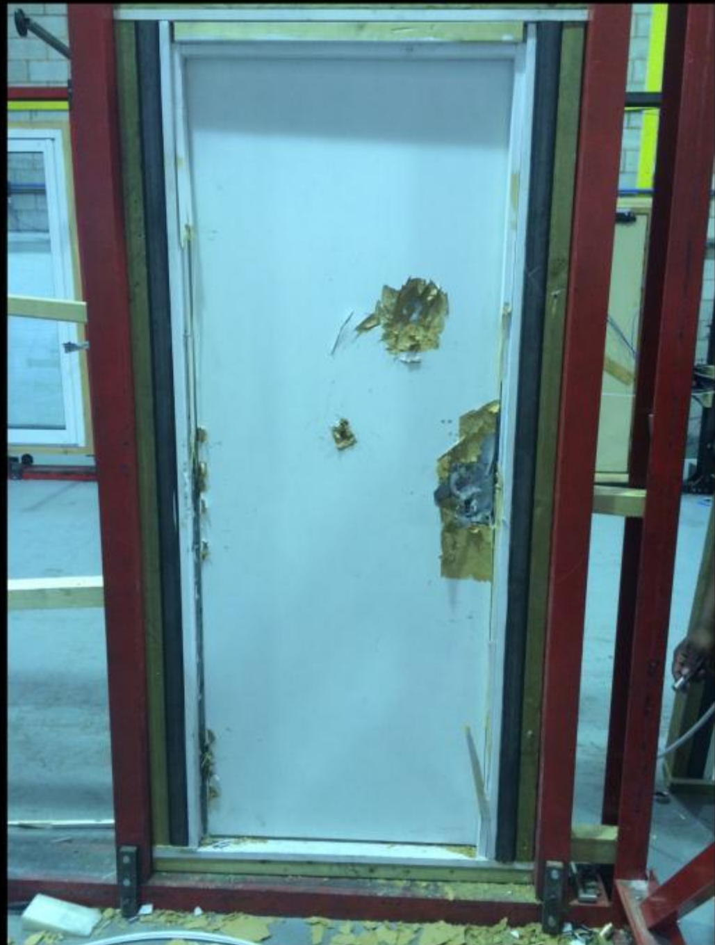
Henleys Security Doors

Damage To External Face and Door Frame. Minor Damage To Outer Lock Plate NO ACCESS GAINED. PASS