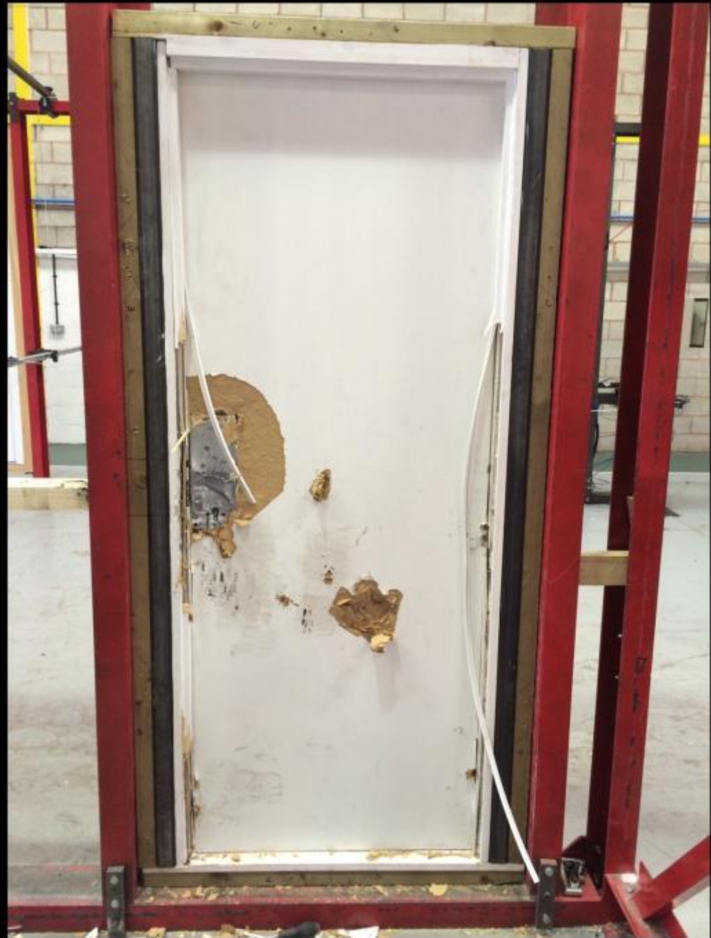
Image Showing The Door Having Minimal Resulting Damage

At This Stage, The Door Has Withstood A Series of Specifically Targeted Attacks For A Period of time Totalling 28 Minutes and Still Remains Un-penetrated